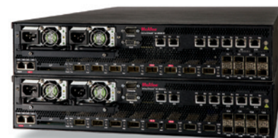
McAfee Network Security Platform M-8000